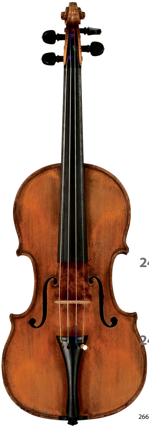
241 AN ITALIAN VIOLIN BY LUIGI MOZZANI, PIEVE DI CENTO, 1927 Bearing the maker's label. LOB 35.7 cm Estimate: $5,000 - 8,000 (EUR 3,205 - 5,128) (GBP 2,500 - 4,000) Ending: Thur., May 8, 2:02 PM EST 242 A CONTEMPORARY ITALIAN VIOLIN BY GUIDO LEONI, SAN BENEDETTO DEL TRONTO, 1973 Bearing the maker's label. LOB 35.6 cm Estimate: $5,000 - 8,000 (EUR 3,205 - 5,128) (GBP 2,500 - 4,000) Ending: Thur., May 8, 2:04 PM EST