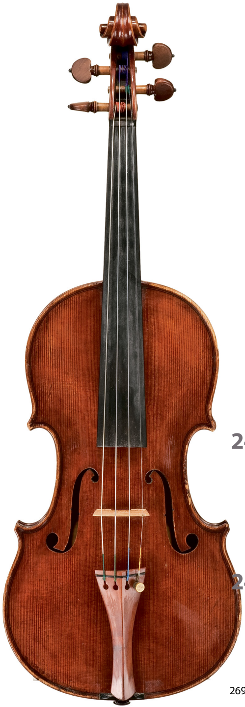
245 AN ITALIAN VIOLIN, c. 1950 Labeled, "Anselmo Curletto..." LOB 35.5 cm Estimate: $5,000 - 8,000 (EUR 3,205 - 5,128) (GBP 2,500 - 4,000) Ending: Thur., May 8, 2:10 PM EST