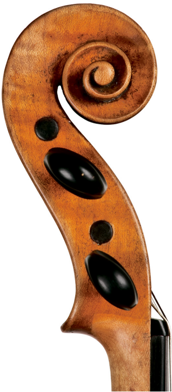
259 A GOOD VIOLIN, c. 1900 Labeled, "Ricardo Antoniazzi, Milan, 1898..." LOB 35.9 cm Estimate: $4,000 - 6,000 (EUR 2,564 - 3,846) (GBP 2,000 - 3,000) Ending: Thur., May 8, 2:38 PM EST