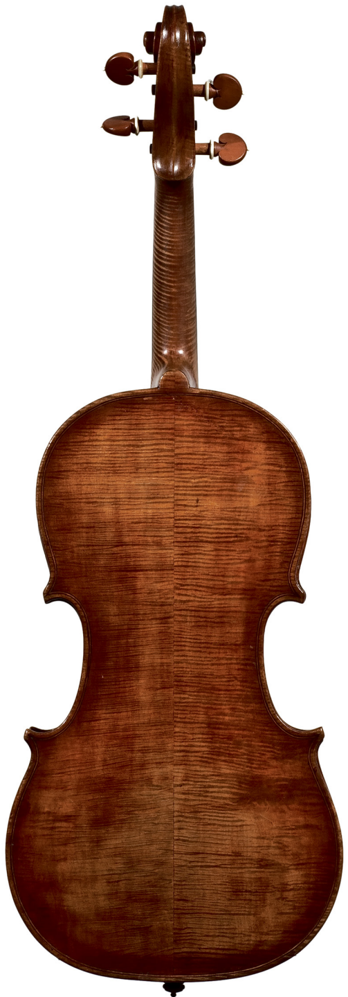
260 A CONTEMPORARY ITALO-ARMENIAN VIOLIN BY MARTIN ERICIAN, PIACENZA, 1988 Bearing the maker's label. LOB 35.4 cm Estimate: $4,000 - 6,000 (EUR 2,564 - 3,846) (GBP 2,000 - 3,000) Ending: Thur., May 8, 2:40 PM EST