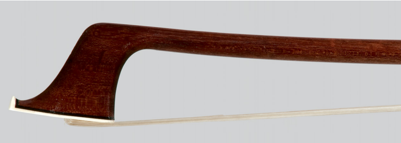
94 A FRENCH CELLO BOW BY CHARLES PECCATTE Unstamped. Silver mounted. 76.5 grams * Sold with a certificate from Salchow & Sons, New York. Estimate: $15,000 - 22,000 (EUR 9,615 - 14,102) (GBP 7,500 - 11,000) Ending: Wed., May 7, 2:06 PM EST