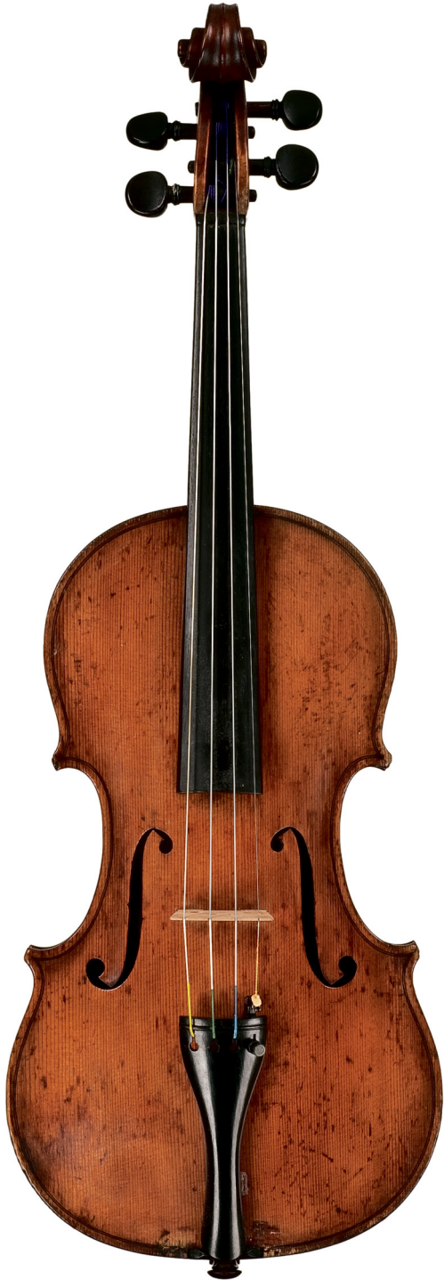
243 A CONTEMPORARY ITALIAN VIOLIN, PROBABLY BY STEFANO CONIA, CREMONA, c. 1970 Labeled, "Pollastri..." LOB 35.4 cm Estimate: $5,000 - 8,000 (EUR 3,205 - 5,128) (GBP 2,500 - 4,000) Ending: Thur., May 8, 2:06 PM EST