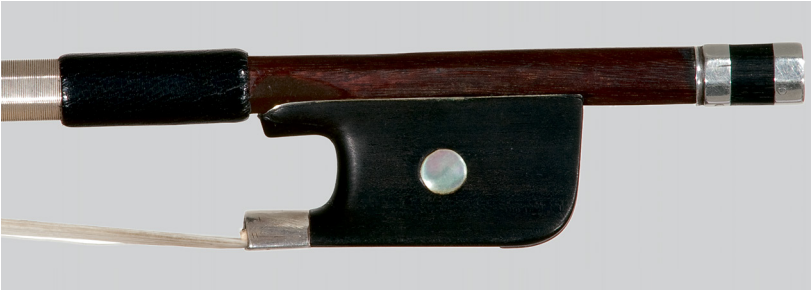
96 A GOOD FRENCH CELLO BOW BY PIERRE SIMON Stamped, "Henry a Paris." Silver mounted. 74.5 grams * Sold with a certificate from Paul Childs, Montrose. Also sold with a certificate from Rembert Wurlitzer, New York (June 3, 1974) ascribing the bow to Joseph Henry. Estimate: $20,000 - 30,000 (EUR 12,820 - 19,230) (GBP 10,000 - 15,000) Ending: Wed., May 7, 2:10 PM EST