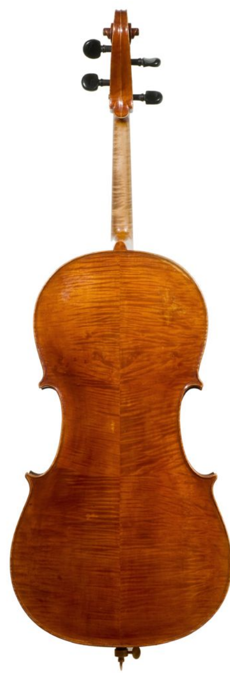
A GOOD ITALIAN CELLO BY EUGENIO DEGANI, VENICE, 1895 Labeled, "Eugenio Degani, Venezia, 1895..." LOB 73.5 cm Estimate: $40,000–60,000