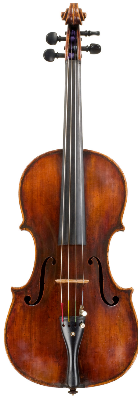
A FINE AND INTERESTING VIOLA, 18 th CENTURY, ATTRIBUTED TO MATTHIAS ALBANI

Labeled, "Dominicus Busan, fecit Venetius, 17..." LOB 40.9 cm