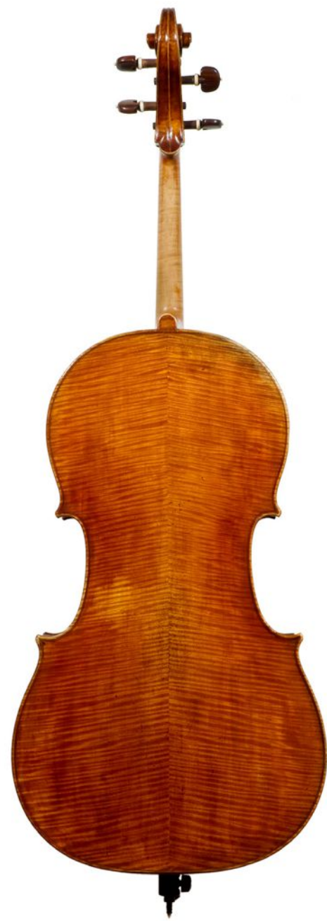
A FINE FRENCH CELLO BY JEAN BAPTISTE VUILLAUME, PARIS, c. 1858 Labeled, "Jean Baptiste Vuillaume..." Lower treble rib replaced. LOB 75.5 cm * Sold with a photocopy certificate from Dario D'Attili, Dumont (August 14, 1987). Estimate: $150,000–220,000