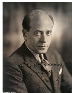
Lot 495, Eugene Ormandy