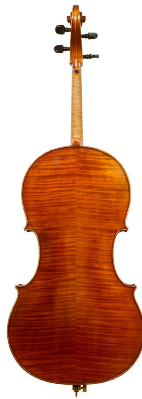
A GOOD FRENCH CELLO BY AMÉDÉE DIEUDONNÉ, MIRECOURT, 1929 Labeled, "Amédée Dieudonné, No. 51 Mirecourt Anno 1929." LOB 75.7 cm Estimate: $18,000–25,000