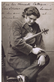
Lot 523, Eugène Ysaÿe