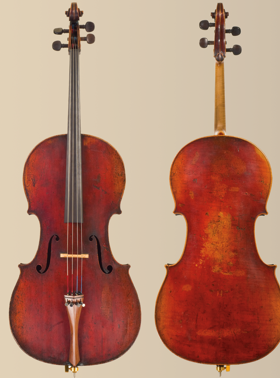
A GOOD FRENCH CELLO, ATTRIBUTED TO AND POSSIBLY BY NICOLAS VUILLAUME, MIRECOURT, c. 1840 Labeled, "Nicolas Vuillaume, Mirecourt, 1841..." The lower treble rib replaced. LOB 75.9 cm Estimate: $35,000 – $55,000