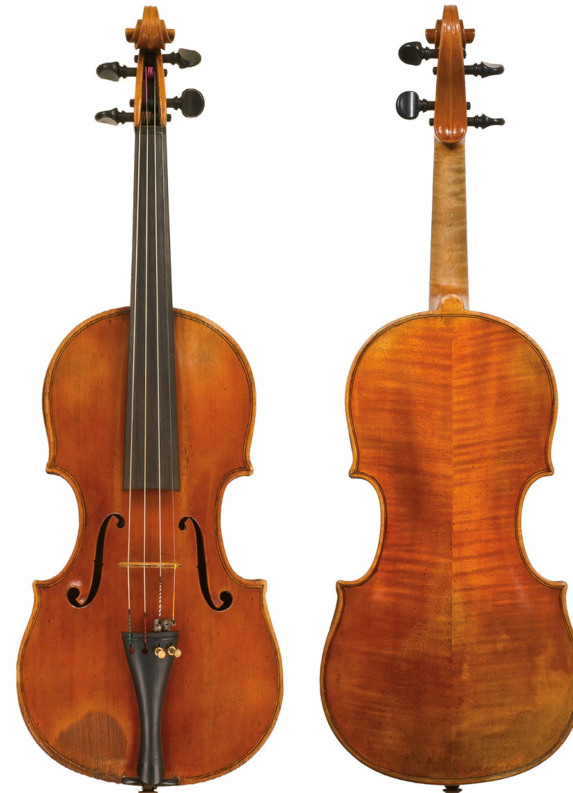
AN INTERESTING VIOLIN OF THE GENOA SCHOOL, ATTRIBUTED TO AND POSSIBLY BY PAOLO CASTELLO

Labeled, "Paolo Castello..." The head by another maker. LOB 36.1 cm