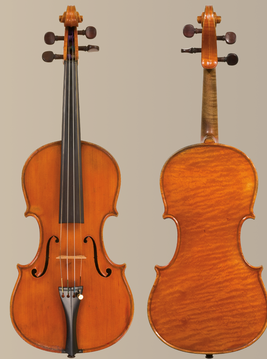
A FINE ITALIAN VIOLIN BY CESARE CANDI, GENOA, c. 1910 Labeled, "Cesare Candi..." LOB 35.5 cm Estimate: $30,000 – $50,000