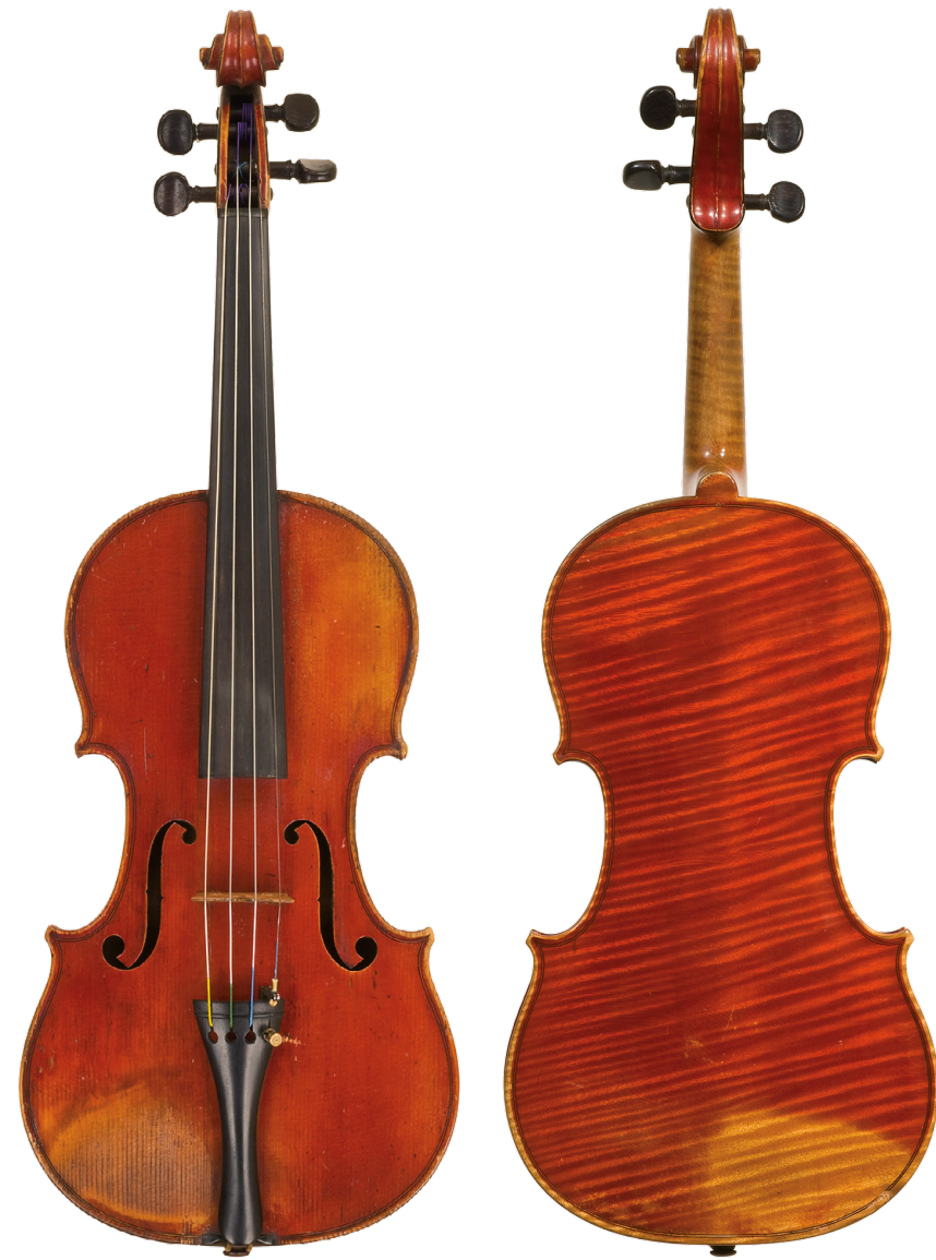
A FINE FRENCH VIOLIN BY GAND & BERNARDEL, PARIS, 1874 Labeled, "Gand & Bernardel, Paris, no. 566, 1874." LOB 35.6 cm Estimate: $15,000 – $22,000