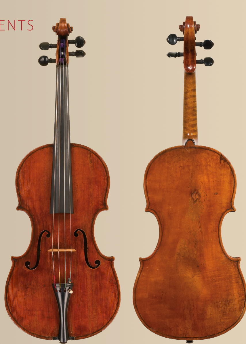
A RARE ITALIAN VIOLA BY PIETRO PAOLO DESIDERI, RIPATRANSONE, 1793 Labeled, "Pietro Paulus, Desideri..." LOB 38.4 cm Estimate: $20,000 – $30,000