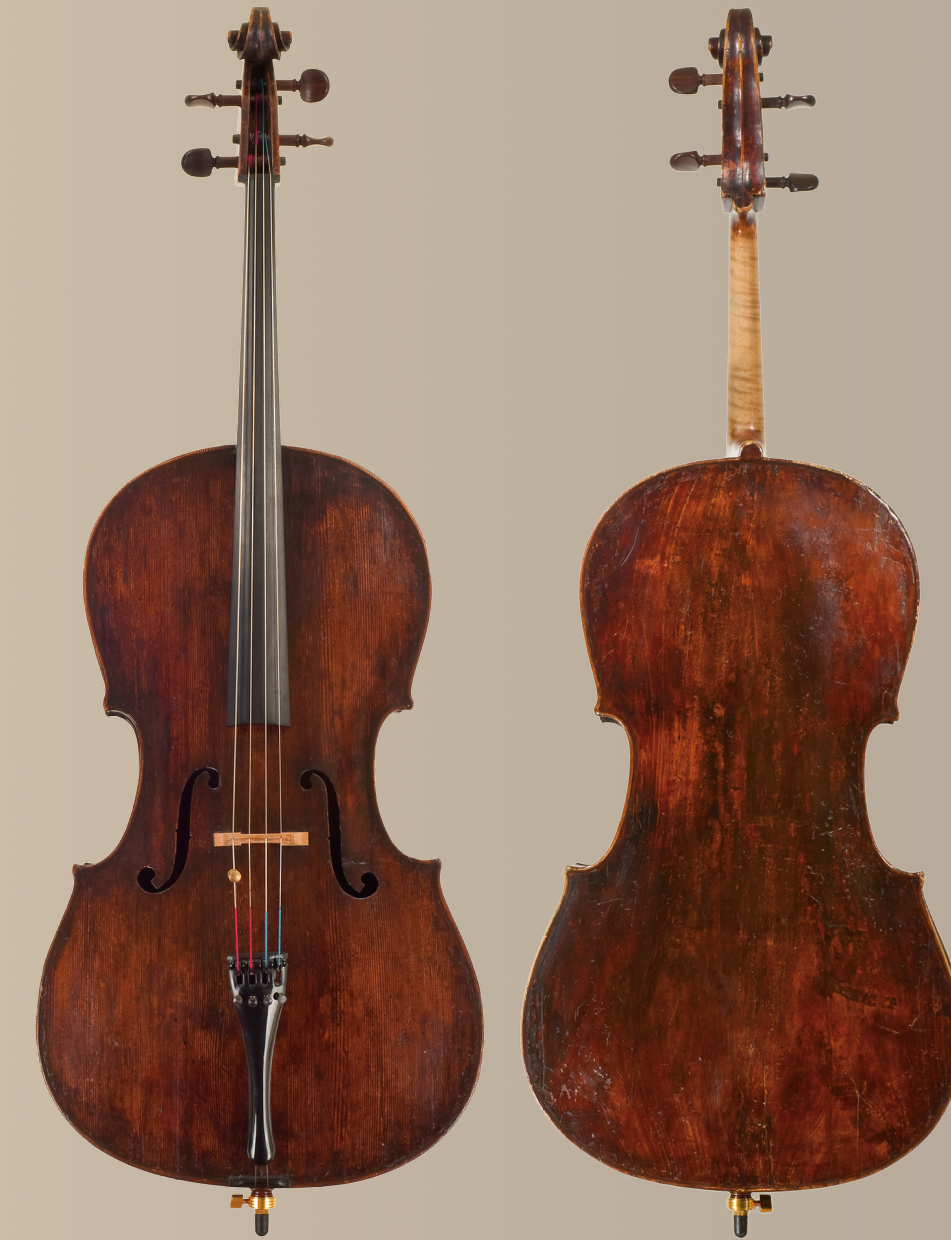
AN INTERESTING ITALIAN CELLO, TESTORE SCHOOL, MID-18th CENTURY Labeled, "Grancino..." Dimensions altered. LOB 76.6 cm Estimate: $40,000 – $60,000