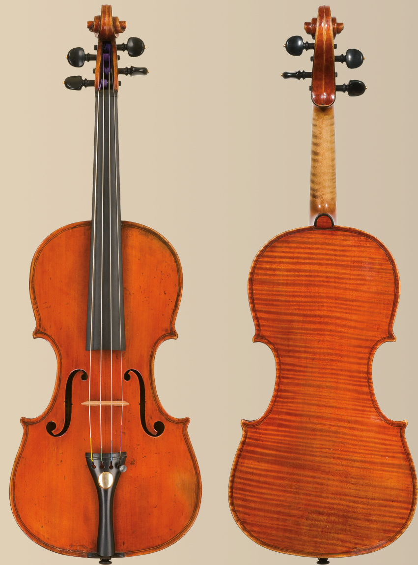
A GOOD ITALIAN VIOLIN BY GAETANO GADDA, MANTUA, c. 1930

Labeled, "Stefano Scarampella, Mantova, 1905..." LOB 35.8 cm