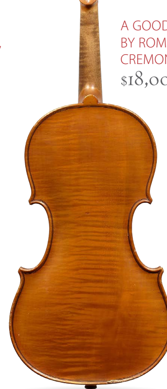
A GOOD ITALIAN VIOLIN BY ROMEO ANTONIAZZI, CREMONA, 1914 $18,000-25,000