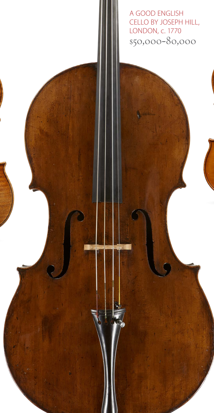
A GOOD ENGLISH CELLO BY JOSEPH HILL, LONDON, c. 1770 $50,000-80,000