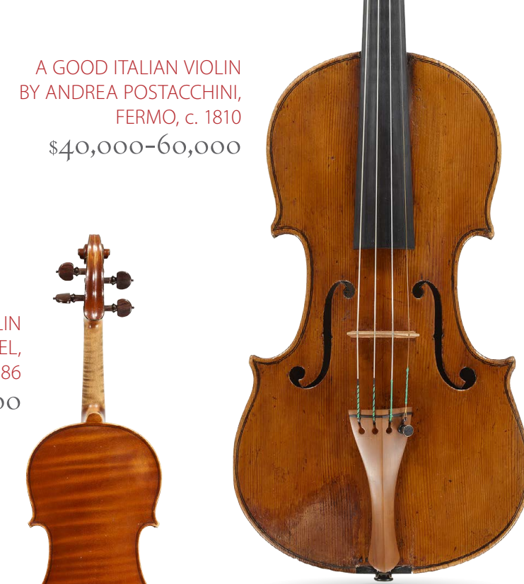
A GOOD ITALIAN VIOLIN BY ANDREA POSTACCHINI, FERMO, c. 1810 $40,000-60,000