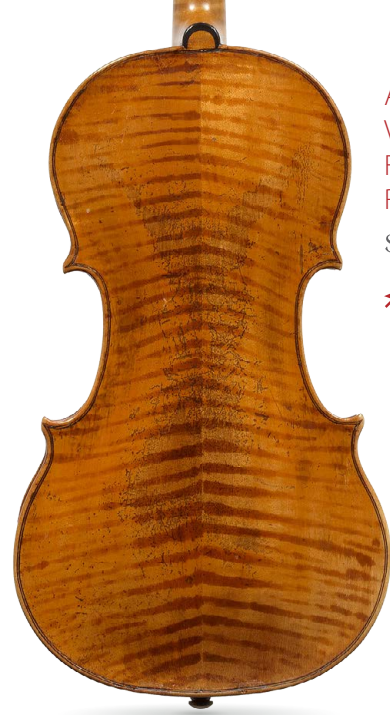
A FINE AND RARE ITALIAN VIOLIN BY GIOVANNI FRANCESCO LEONPORI, ROME, 1759 $50,000-80,000

➤ Read more tarisio.com/may2011-leonpori