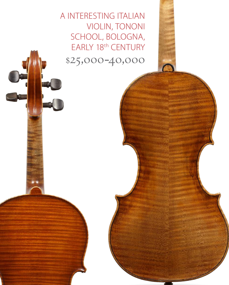
A INTERESTING ITALIAN VIOLIN, TONONI SCHOOL, BOLOGNA, EARLY 18 th CENTURY $25,000-40,000