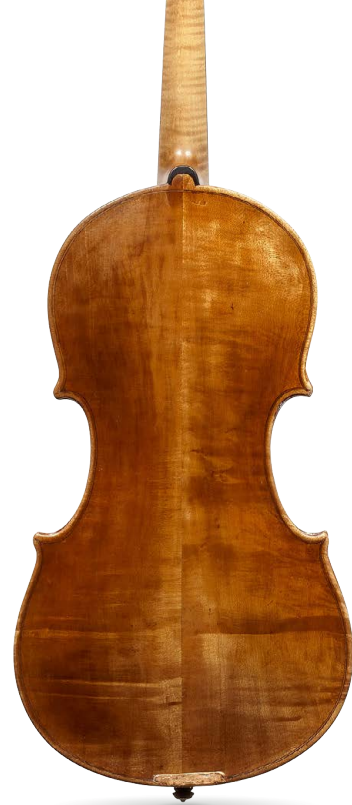
A GOOD ITALIAN VIOLIN BY FRANCESCO MAURIZI, APPIGNANO, c. 1880 $30,000-50,000