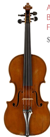
AN ITALIAN VIOLIN BY IGINIO SDERCI, FLORENCE, c. 1925 $16,000-25,000