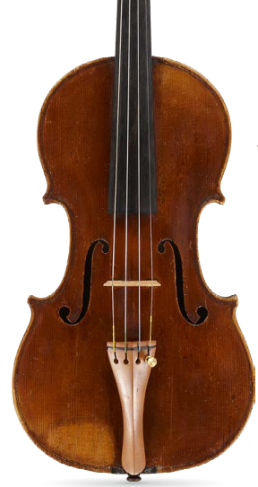
A GOOD ITALIAN VIOLIN BY ANNIBALE FAGNOLA, TURIN, c. 1925 $40,000-60,000