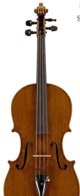
A GOOD FRENCH VIOLIN BY ALBERTO ALOYSIUS BLANCHI, NICE, 1910 $12,000-18,000